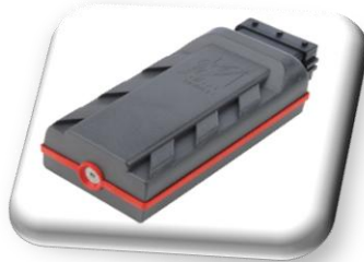
Diesel Power Module

Module Setting: Recommend “C” Setting for Optimal Performance.