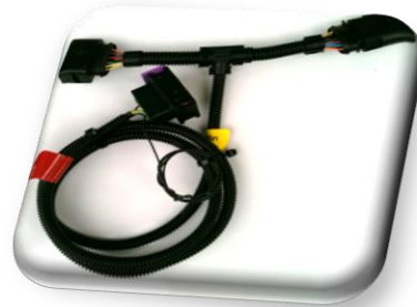
Diesel Power Harness